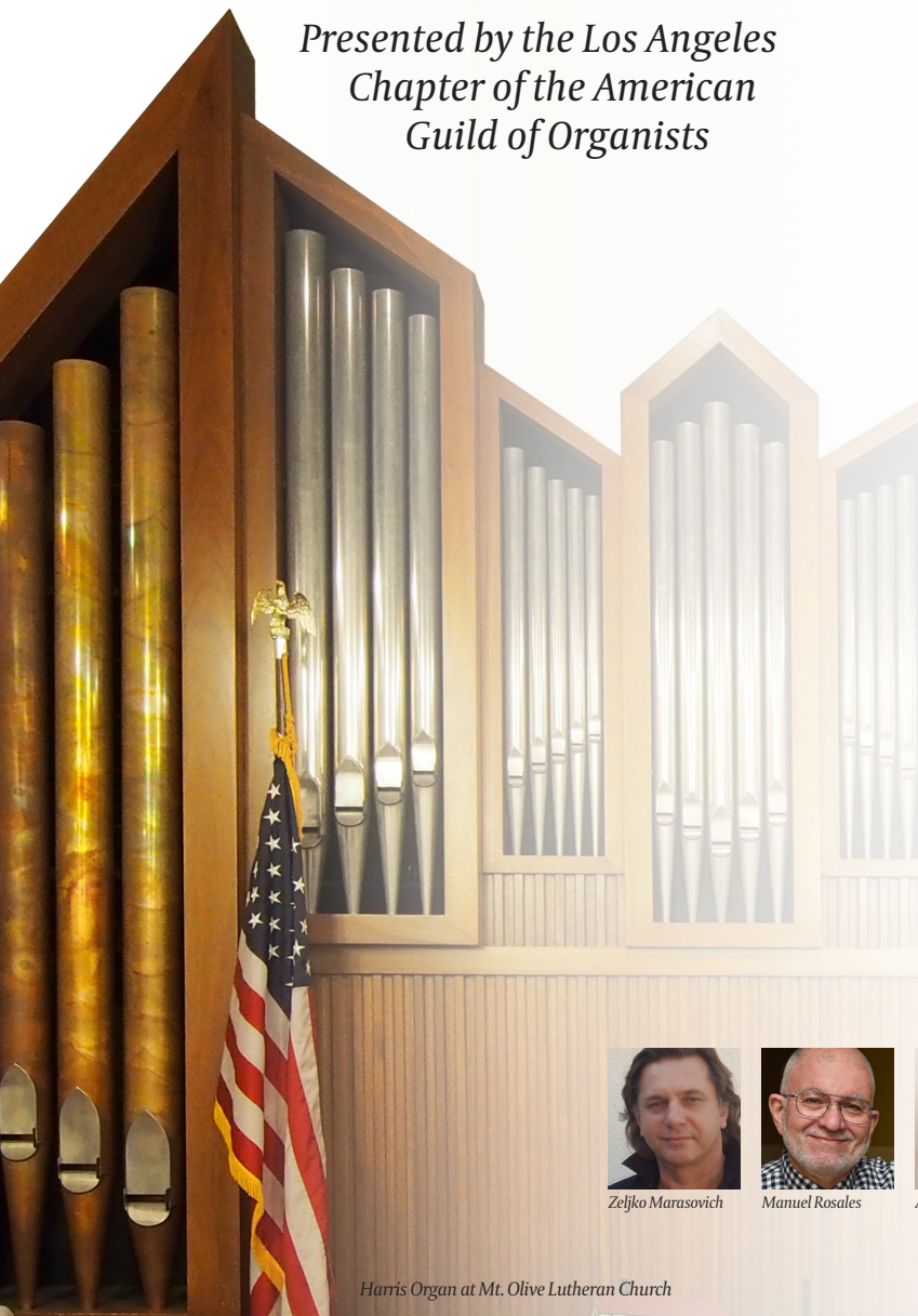
Harris Organ at Mt. Olive Lutheran Church

Presented by the Los Angeles Chapter of the American Guild of Organists